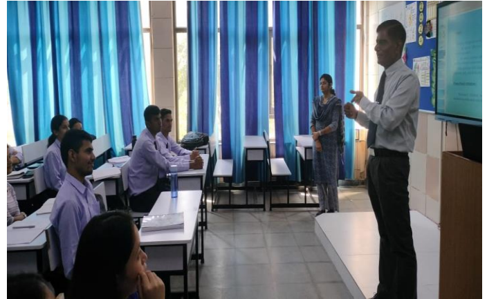
Glimpses of 'Orientation programme' (16 th January 2025)